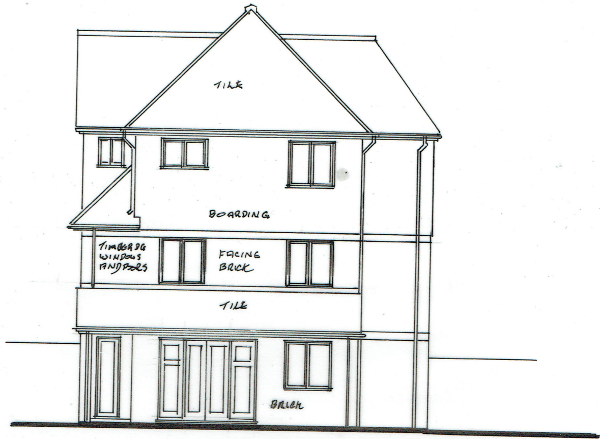
EXISTING SOUTH WEST ELEVATION (FRONT)